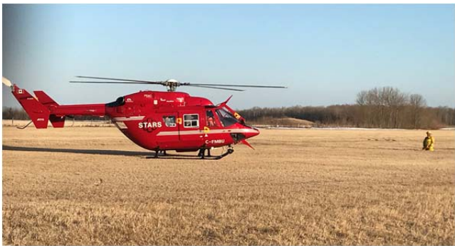
STARS Landing at Langruth Sports Grounds

You are helping us fight for life. For more information please https://www.stars.ca/ .