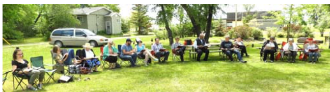
Community Church Service at Einarson Park