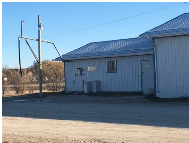
Langruth Water Treatment Plant

For those who rely on this reservoir and treatment plant for their potable water, it is reassuring news that access to water through the winter months shouldn't be disrupted. Thank-you to the municipality for responding to the needs of the community in a timely fashion.