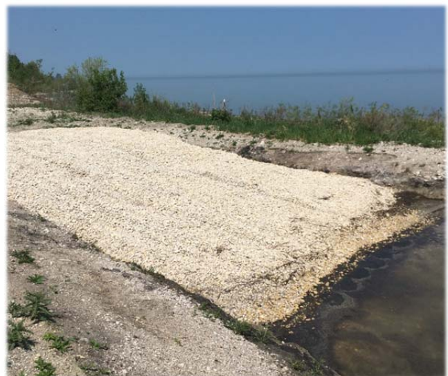
First Stage of Big Point Boat Launch Construction