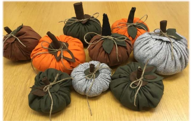
Craft Night Felt Pumpkins

Recreation and Leisure Administrator Municipality of West-Lake Gladstone Direct line: 431-894-850 rec@westlake-gladstone.ca