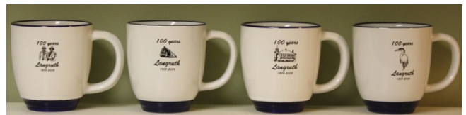
Langruth Centennial Mugs

Centennial mugs, pins and history books are still available for purchase. All sales will go to the Langruth Rec. Committee to be used at the hall. Contact Lynne at 204-445-2254 if you are interested in purchasing any of these memorabilia.