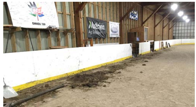
Boards reattached to new screw pile posts.