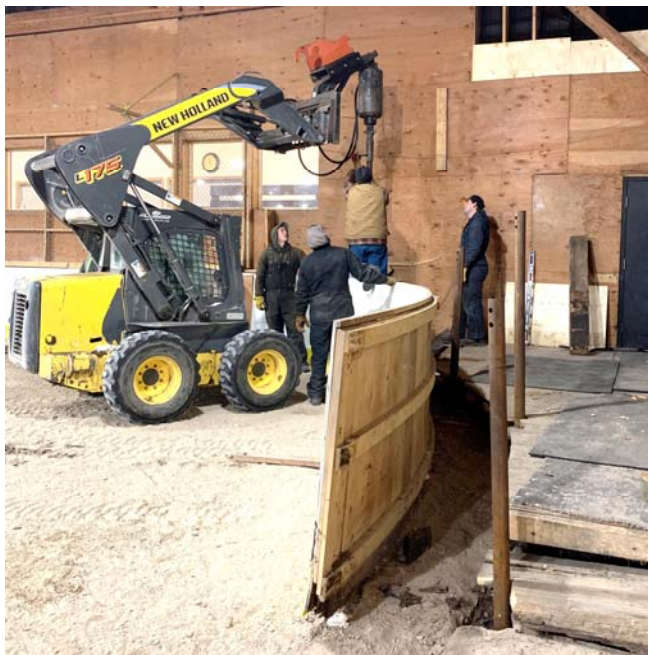
Installing new screw pile posts.