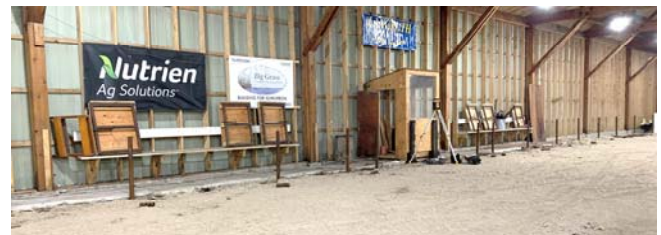
New posts installed and ready for boards.